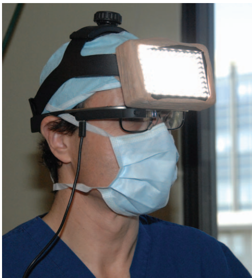
Fig. 4. Light-emitting diode headset used to augment Google Glass recording quality during procedures with limited lighting, such as rhinoplasty. The power cord leads to a battery in the rear pocket.

Closed rhinoplasty has also been performed using Glass by the senior author. This procedure is perfectly suited for broadcasting by means of Glass, given the restricted observer view. Surgical field illumination and resultant video quality was augmented by fashioning a headset with a powerful video light-emitting diode (LED) lamp (Fig. 4). This serves a dual function of improving image