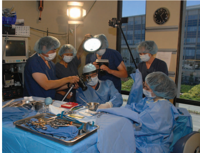
Fig. 5. Surgical recording using traditional methods as a comparison to Google Glass.

positive support for Google Glass in the medical and scientific setting. Battery life, ergonomics, photographic/video quality, and cellular/streaming capabilities could all be improved.